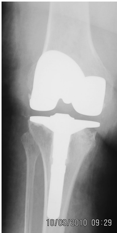
Fig. 3 AP view shows partial reabsorption of the graft

was judged to be correct, with an orientation within 3^\circ to the preoperative joint line in all cases. Serial radiographs demonstrated progressive subsidence of the implant prior to the revision surgery. In the remaining three cases, the defect was segmental with interruption of the cortical rim. In these cases, the sizing of the tibial component was judged to be appropriate. In these cases, the analysis of pre-UKA radiographs revealed that the native posterior tibial slope was not restored. In these circumstances, an insufficient slope may lead to posterior overload during knee flexion with increased risk of tibial tray collapse into the host bone. No intraoperative complications were recorded.